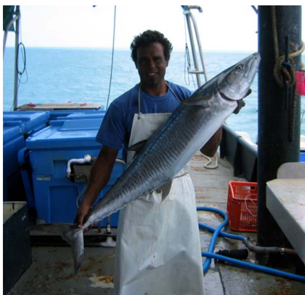
Discrete populations: Spanish Mackerel.

Another method to identify fish populations is to determine whether their parasite faunas are spatially discrete or intergradational. This is the approach taken by Charters et al. (2010) for the commercially important in-shore fishery of Grey Mackerel Scomberomorus semifasciatus . The authors identified four populations in the region.