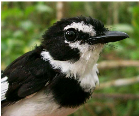
Black-sided Robin, photographed near Jayapura, Papua