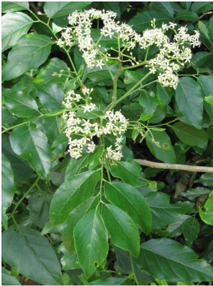
Attracting butterflies: Lime Berry Micromelum minutum .

On Sunday 14 February around 15 people met at 9am in the 'Pee Wee's at the Point' car park. The site was full of birdsong and butterflies, accompanied by the occasional air-raid siren or waft of brass-band music from the open day at the nearby East Point Military Museum, and with a back ground of high-revving micro-engine noise from the nearby East Point Aeromodellers Club. We were promised Rainbow Pittas ( Pitta iris ); once we were inside the forest, three or more birds obliged with calling but not everyone managed a sighting. Not to worry. There was enough butterfly and bird action – not to mention plant ID-ing to keep us occupied until midday. Fiona Douglas and Don Franklin took us on a gentle ramble along the tracks through the monsoon vine forest.