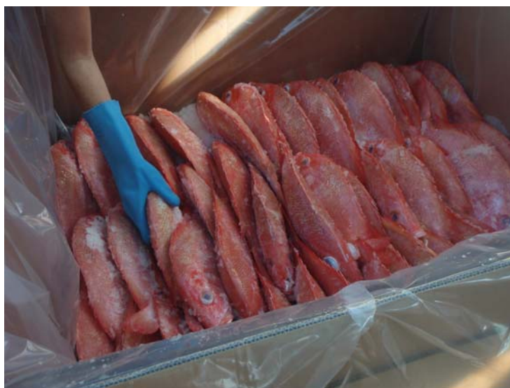
Slow growing and long-lived: Red Snapper.

It makes a big difference to sustainability whether one is fishing a single larger population of a species or a number of smaller populations. Using chemical (isotope) analysis of otolith bones, Newman et al. (2009) showed that the Narrow-barred Spanish Mackerel Scomberomorus commerson population in northern Australia including the Gulf of Carpentaria is distinct from those of seas of the north-west and east of Australia (i.e. few individuals move from one population to the other) – and should thus be managed as a discrete fishery.