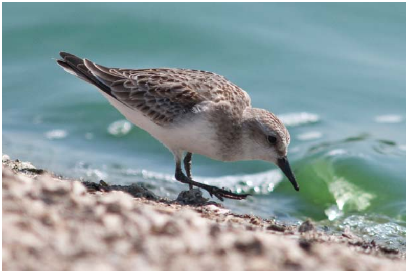
The Red-necked Stint was very much more numerous during the September to December period than the dry season months.

The twelve most frequently seen species for September to December does not include two species listed on the May to August tables ( Nature Territory Oct. 2009), Eastern Curlew and Common Sandpiper. Although their numbers also increased, the increase was not as great as for many of the species listed in this report.