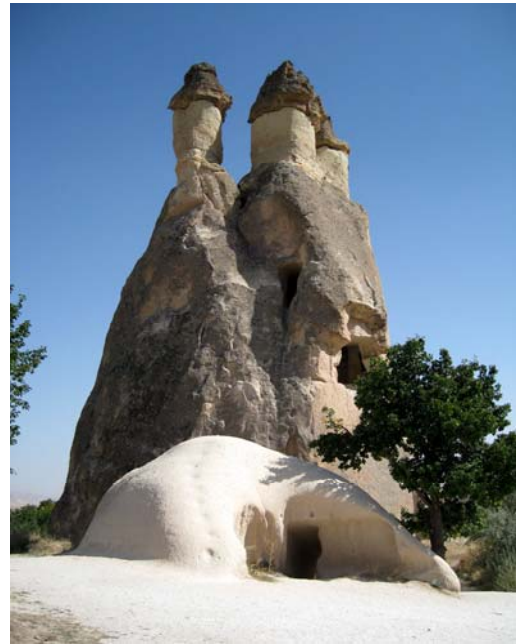
Mushroom peaks of naturally eroded volcanic ash (tuff).

Many thanks to Gay for providing a whirlwind tour of this fascinating country. No doubt you have inspired members to add Turkey to their list of places to visit.