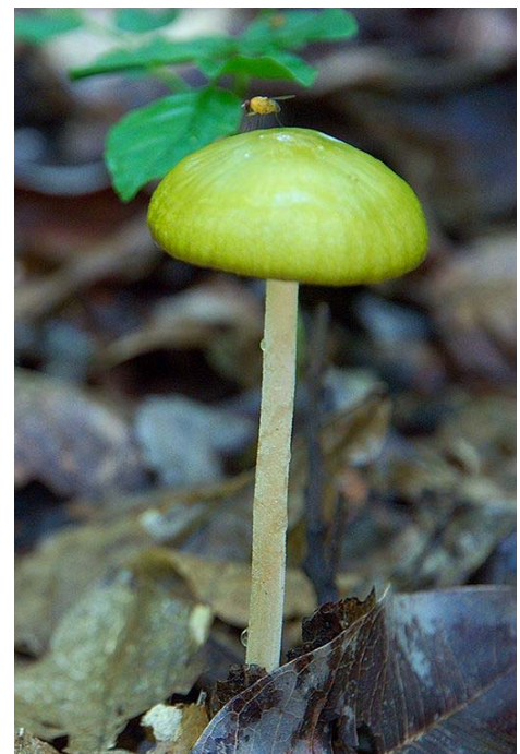
One of many fungi (right).