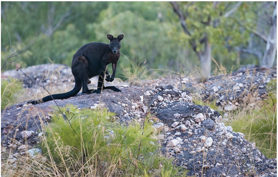
Fig. 1. Black Wallaroo ( Macropus bernardus ).

In a 1998 paper, Telfer et al. compiled Aboriginal knowledge of rock kangaroo feeding habits that included numerous anecdotal accounts of opportunistic macropod frugivory – even though the dominant understanding of foraging behavior has defined these animals as intermediate browsers/grazers (Tuft et al. 2011). A later study (Telfer and Bowman 2006) using scat contents to explore niche separation among northern macropods found that at least one of the species, Macropus bernardus , may be able to inhabit the most rugged and severe habitat because of its ability to utilise leaves, fruits and seeds from a range of rock-specialist plants during dry seasons. In conjunction with this work, Telfer et al. (2006) designed a scat identification key to determine current