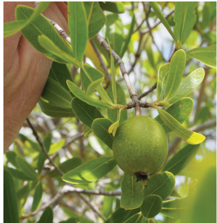
Fig. 2. Developing fruit of Gardenia fucata growing on sandstone outcrop near Cahills Crossing, East Alligator region, Kakadu National Park (CTM 4001). (Chris Martine)

While previous scat analyses (Telfer & Bowman 2006) and compilation of local Indigenous knowledge (Telfer et al. 1998) suggested that Black Wallaroos occasionally eat fruits and seeds, no empirical evidence for their role as effective seed dispersers has been previously established. Our results show that Black Wallaroos in the East Alligator region of Kakadu National Park occasionally ingest the fruits of Gardenia fucata and that those seeds are not only passed intact in scat but are also able to germinate at a high rate (100%; n=7). In